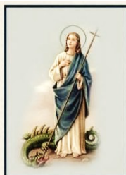
Saint Martha Pray for Us

SUNDAY 07/28: 8:00AM *10:00AM MONDAY 07/29: 8:15AM TUESDAY 07/30: 8:15AM WEDNESDAY 07/31: 8:15AM THURSDAY 08/01: 8:15AM FRIDAY 08/02: 8:15AM SATURDAY 08/03: 5:00PM (Sunday Vigil) SUNDAY 08/04: 8:00AM *10:00AM